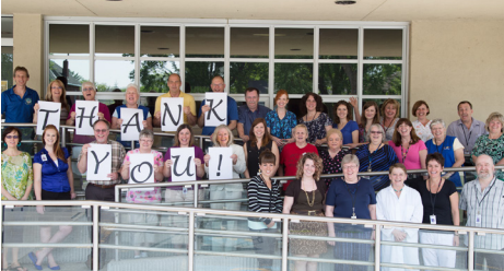
A HUGE THANK YOU FROM ALL OF US!

“We are very fortunate to live in a community that cares about its hospital and we, as a foundation, will be do whatever we can to make sure it is around for many years to come,” she added.