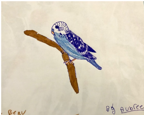
Cutline: Aubree's Drawing